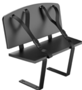
2 nd seat

The cushion is made of the soft gauze material Ventisit. It is an ideal accessory to make the seat even more comfortable. The cushion is provided with strips of Velcro so it can be removed and installed quickly and easily.